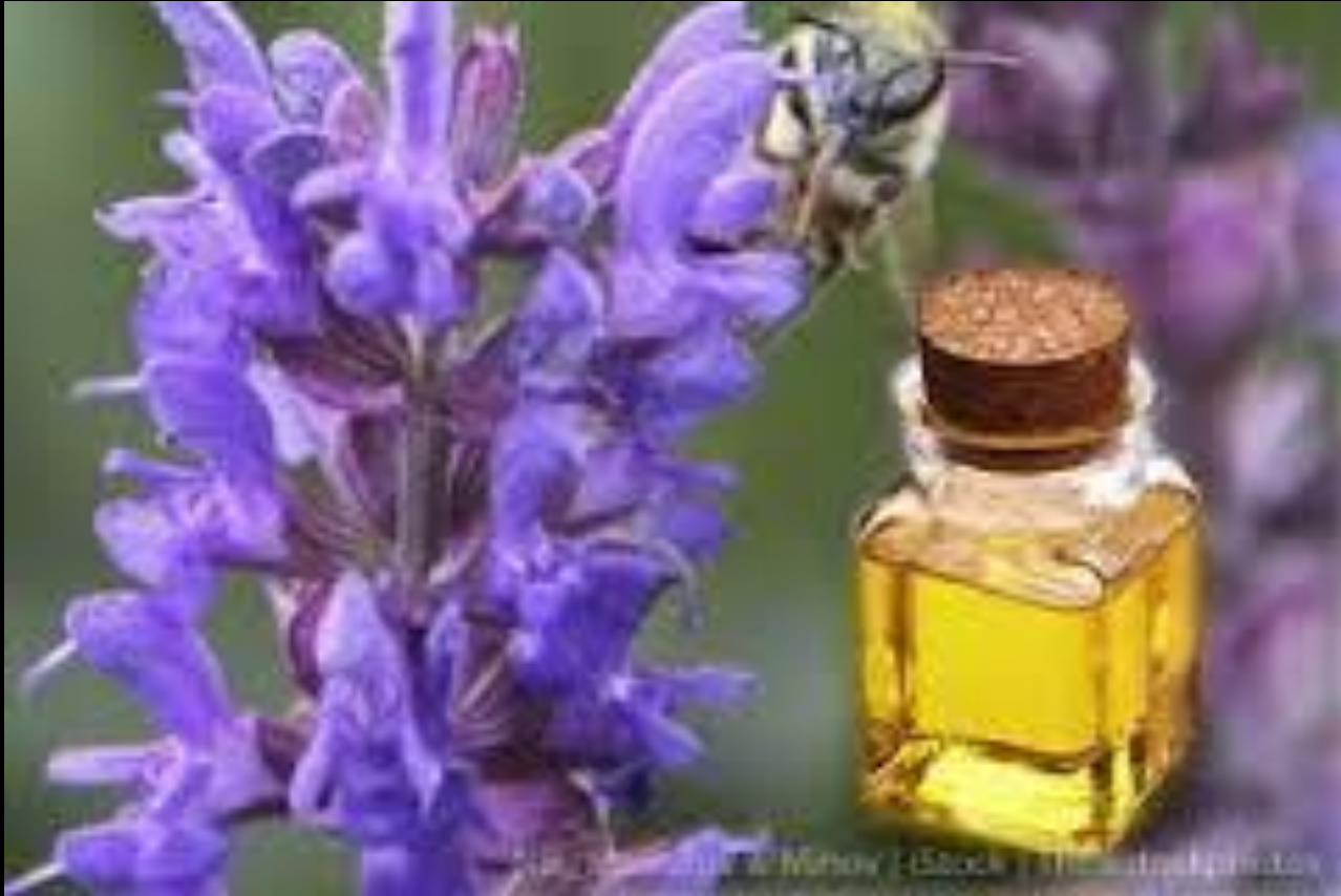
Hyssop Flower and Hyssop Essential Oil