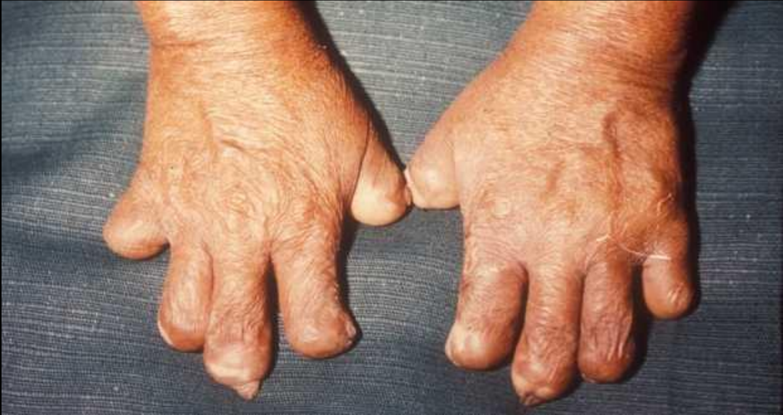
Leprosy Patient's Hands