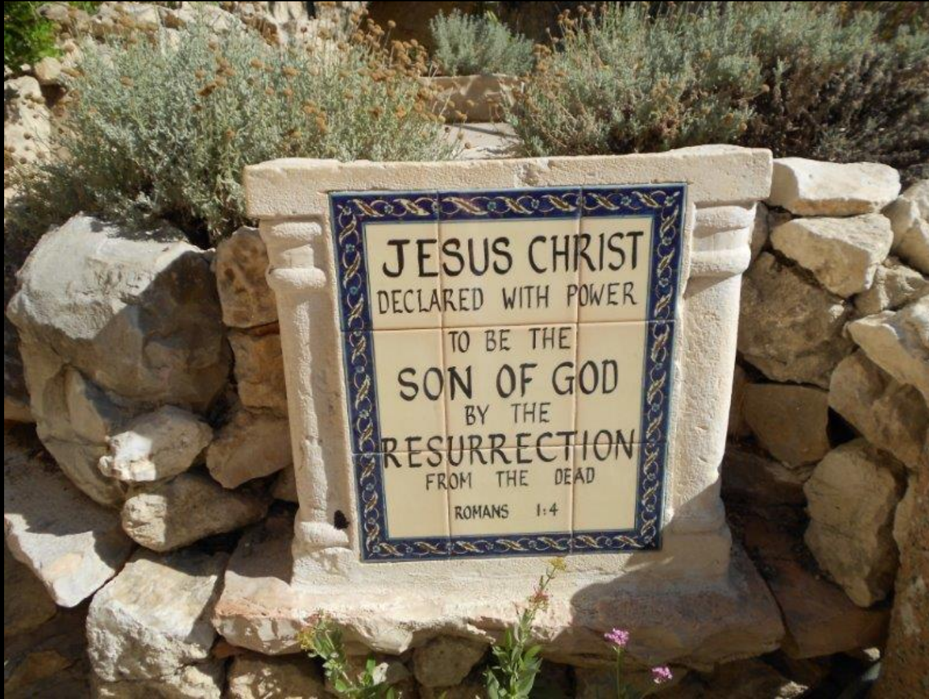
Inscription at Garden Tomb, Jerusalem