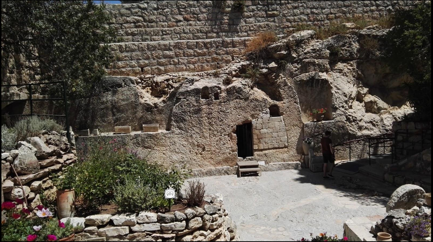
Garden Tomb, Jerusalem