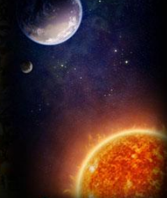
Sun, moon, and stars