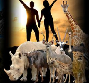
Land animals, Adam and Eve