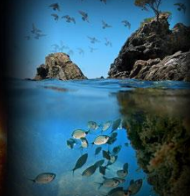
Birds, and sea creatures