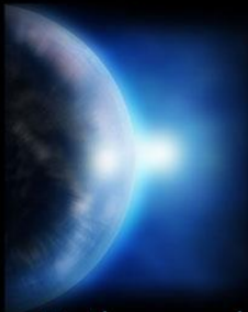
Earth covered by water, light