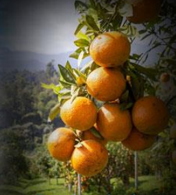
Dry land, plants and fruit trees