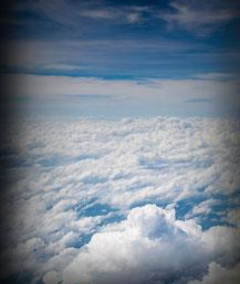
Atmosphere and sky